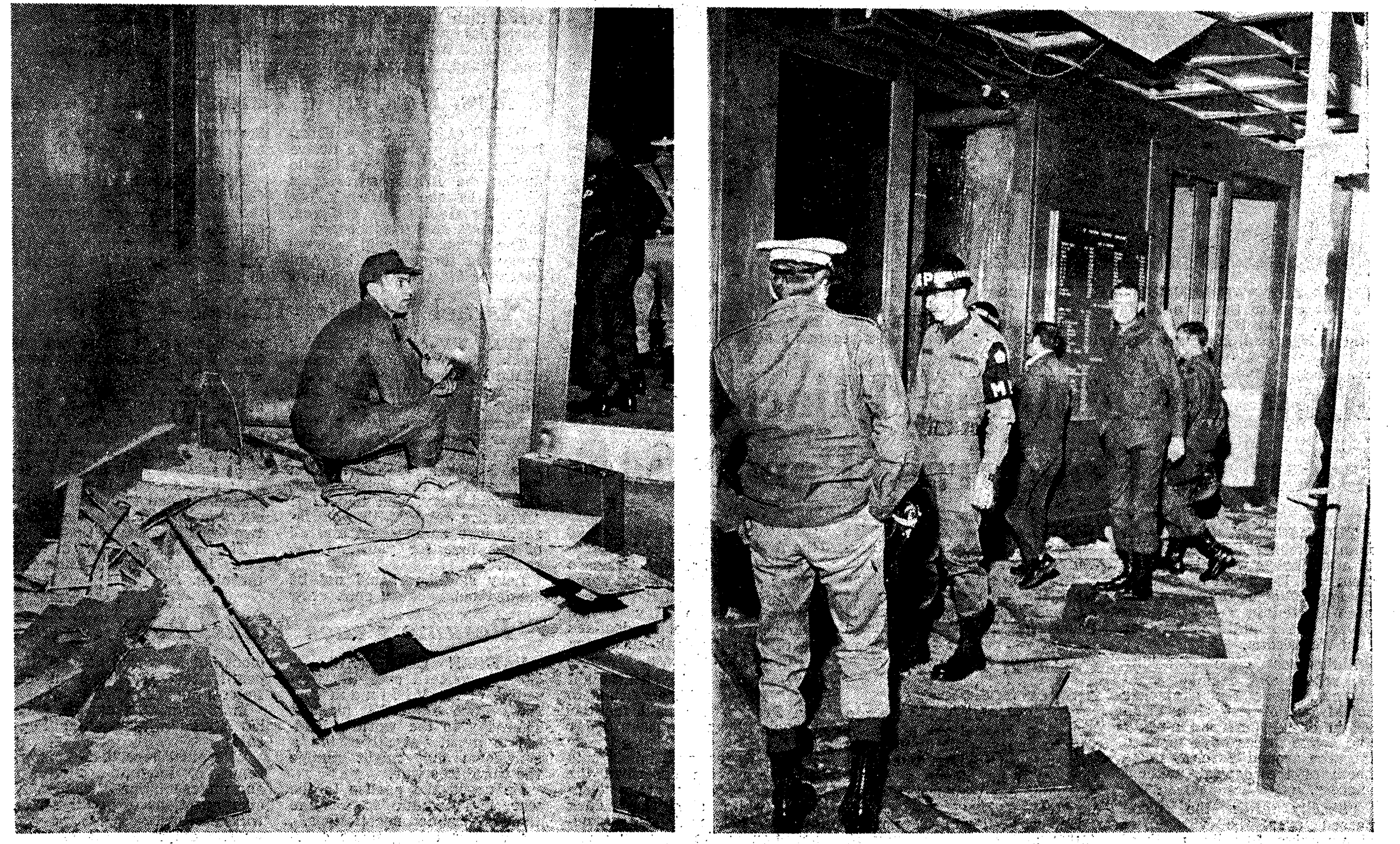
dentified military policeman stands between the shattered glass doors at the entrance to the I.G. Farben Building.

BOMB FRAGMENTS CHECKED—An EOD (explosive ordnance disposal) man holds some bomb fragments in his hand as he sifts through the debris